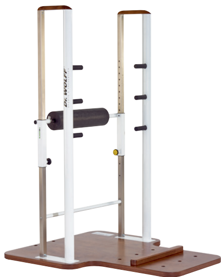
LAT & ARM 413