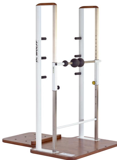
BACK & NECK 416