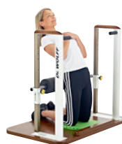
Posterior thigh / calve